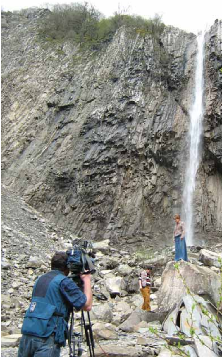
The International Center for Journalists Seminar on Environmental Coverage in Azerbaijan