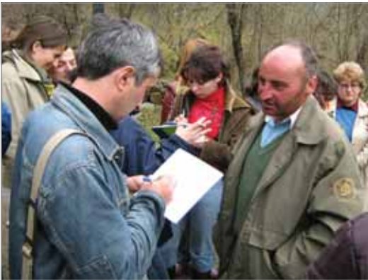
The International Center for Journalists environmental reporting workshop in Georgia